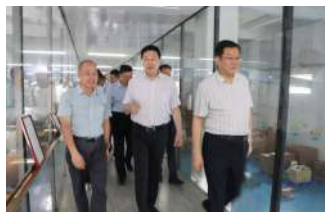
自治区政协副主席何幸幸，北海市委书记蔡锦军一同到公司调研