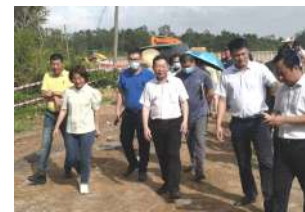
自治区文旅厅厅长欧余军到公司养殖基地进行调研