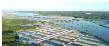
Sea duck breeding base

全国3大工厂，厂房面积超过22000平米 Three major factories in China with a factory area exceeding 22000 square meters