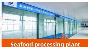
Seafood processing plant