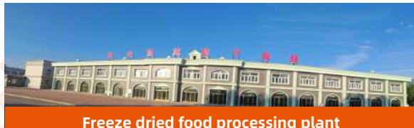
Freeze dried food processing plant