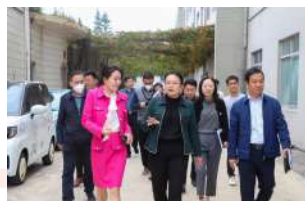
梧州市委常委、市政府党组副书记、副市长谭秀洪到公司调研